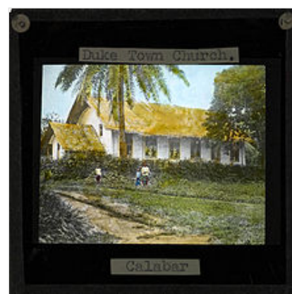
Duke Town Church, Calabar, late 19th century