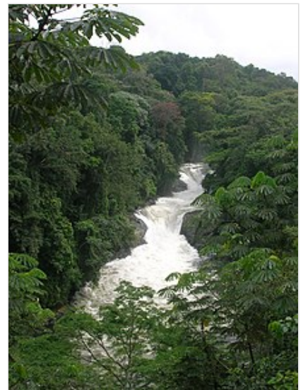
The Kwa Falls

The Kwa Falls is an impressive waterfall characterised by a narrow, steep gorge from top to bottom. The sparkling water plunges into the depths and forms a pool that is ideal for a variety of water sports. Anyone can go swimming here. [42]