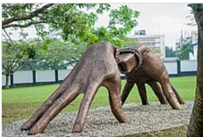
The Calabar hand sculpture

The National Museum was once the home of a British governor. It is located in Calabar, Cross River State, and displays unique artefacts and historical heritage.