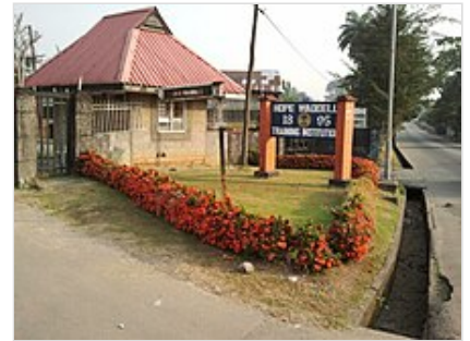
The Hope Waddell Training Institution

Founded in 1895, the Hope Waddell Training Institution was renovated after a long period of neglect and is once again functioning as a high school. Nigeria's first president Azikiwe received his secondary school leaving certificate here. [50]