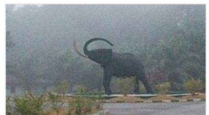
Cross River National Park

Cross River National Park is located north-east of Calabar and borders Cameroon. The Nigerian federal government is courting investors to develop the potential of ecotourism in this and other national parks. [45] The park's motto is "The Pride Of Nigeria". The Kanyang Tourist Village, about an hour's drive from Calabar, will provide visitors with a base from which to visit the park and will have a lodge, restaurant and wildlife museum. Activities include game viewing, bird watching, gorilla tracking, mountain climbing or hiking, sport fishing, boat cruises and the Botanical Gardens and Herbarium at Butatong. [46]