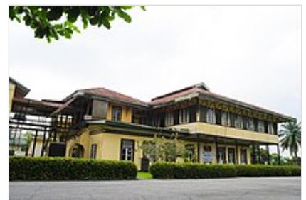
National Museum Calabar

The National Museum of Calabar was flatpacked, shipped from Britain and built in 1884 [30] (it is sometimes incorrectly stated to have been built in 1959). It was formerly the government building or the governor's residence during colonial rule, which was built in Britain and then shipped in parts to Calabar. The Calabar National Museum is made of old Scandinavian pine and has preserved centuries-old relics, especially documents, furnishings and artefacts from the colonial era. [31] The museum houses the relics of the slave trade, including the names of the people who supported the slave trade and the currency of the slave trade. The Calabar National Museum, designed and built by the colonisers in Glasgow, houses souvenirs from the slave trade. In 1959, the building became a national monument. [32]