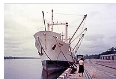
A merchantman docked in Calabar, 1981