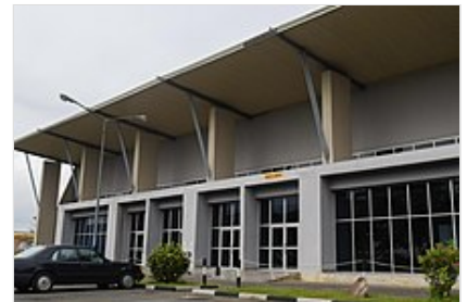
Margaret Ekpo International Airport

Margaret Ekpo International Airport was inaugurated in 1983 by the then President Shagari. Lufthansa , British Airways and KLM/Air France fly to the airport from Calabar with a stopover in Lagos or Abuja (the last leg of the flight is operated by the regional airlines Air Peace , Ibom Air and Aero Contractors ).