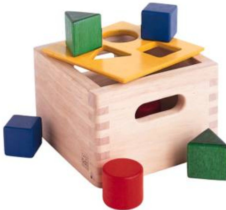
Figure 2.2: Box and blocks analogy from childhood memory: the holes on one end correspond to input templates, the holes on the other end correspond to output templates. Imagine blocks going in through one and out through the other. The blocks themselves correspond to input or output files with attached metadata . Profiles describe how one or more input blocks are transformed into output blocks, which may differ in type and number. Granted, I’m stretching the analogy here; your childhood toy did not have this magic feature of course!