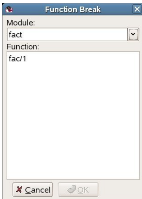
Figure 2.3: Function Break Dialog Window

A function breakpoint is a set of line breakpoints, one at the first line of each clause in the specified function.